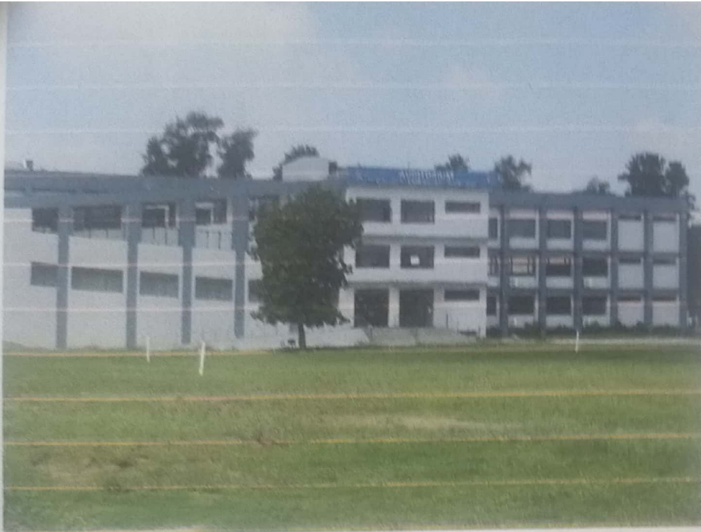
Building with Auditorium