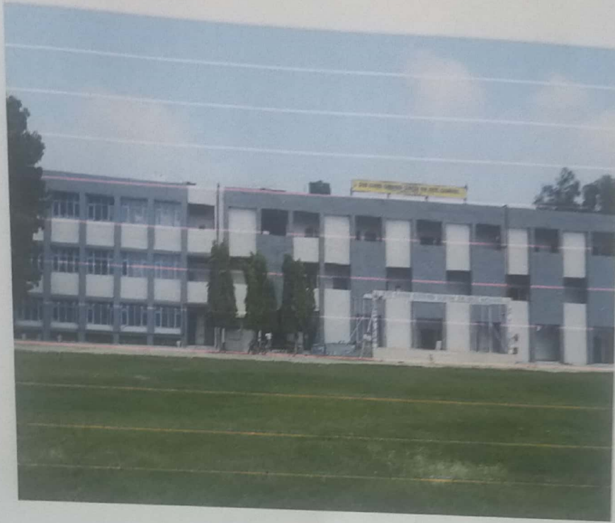
Three storeyed Building Block & View of Class room