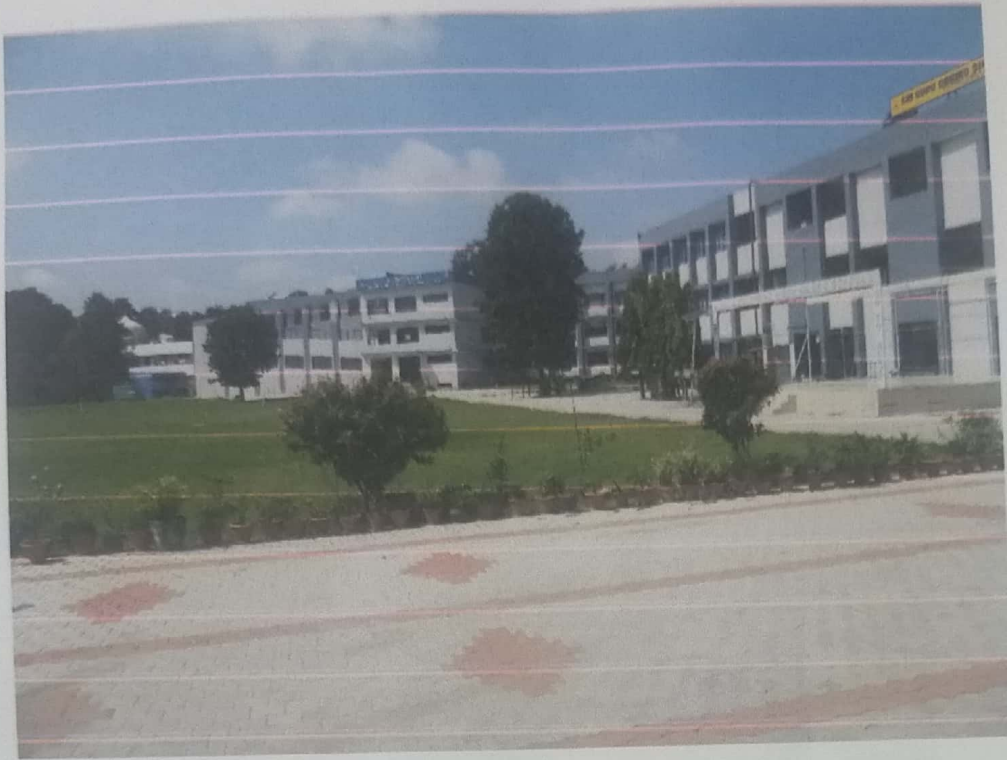
Triple Storeyed Blocks of School Buildings with Lush Green Lawns in Front