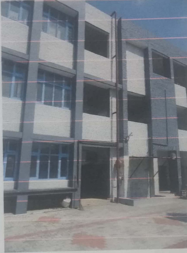
Entrance to Building