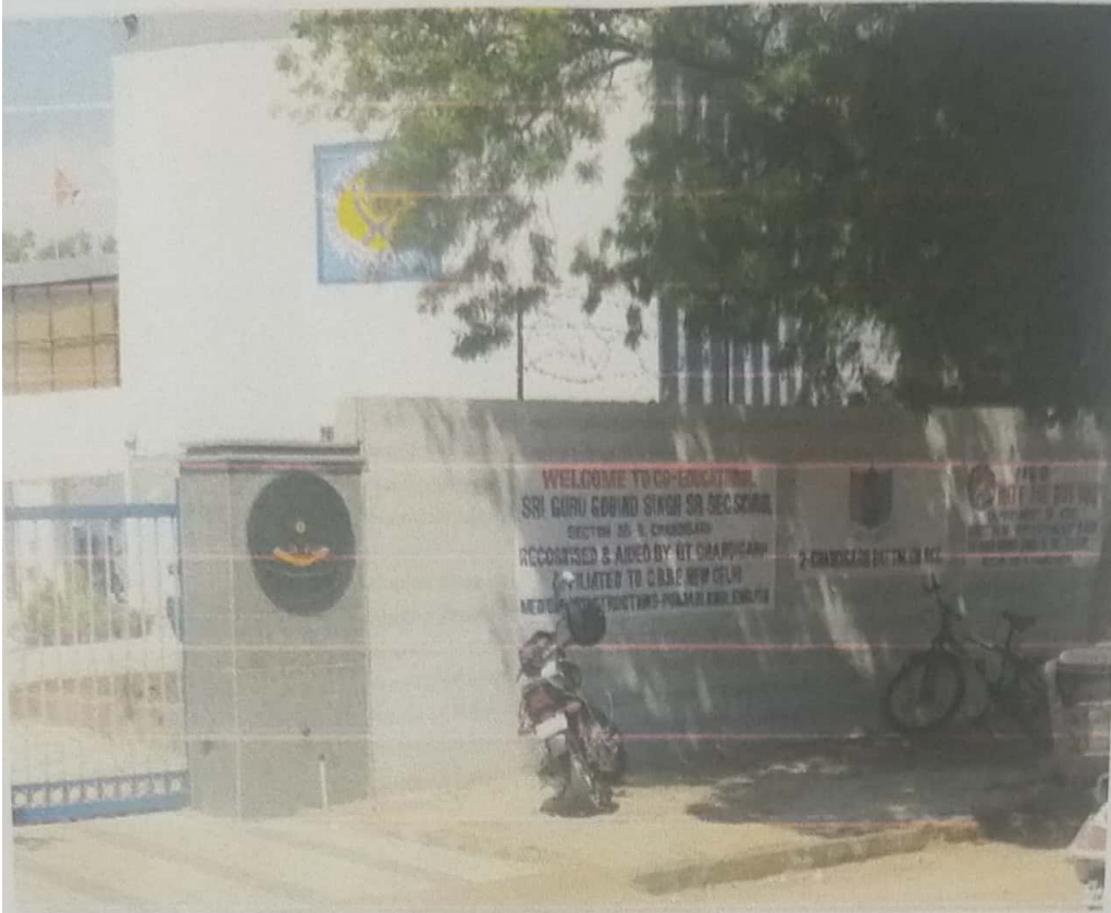
Main Gate of School