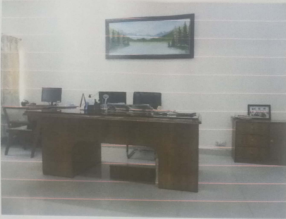
Office of School Principal