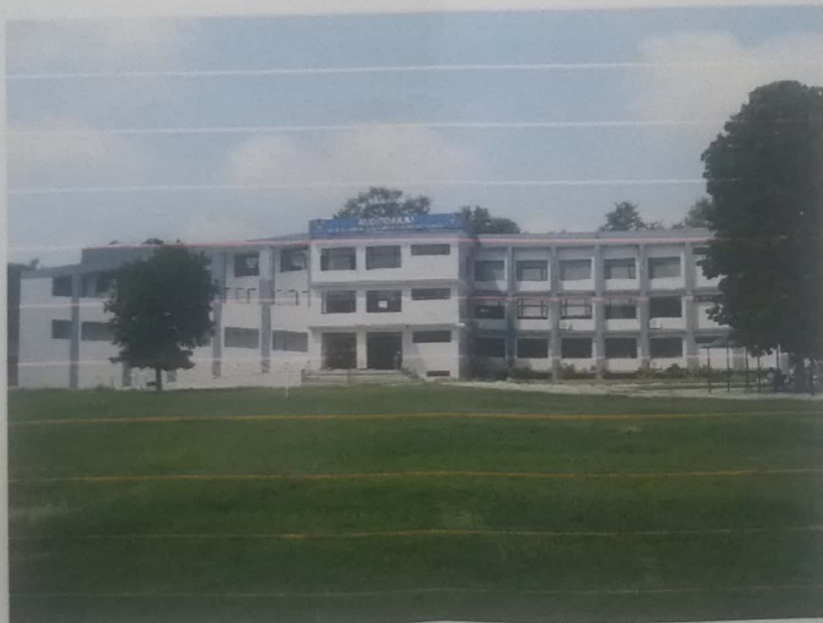
View of Building